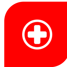
LIMITED PURPOSE HEALTH FLEXIBLE SPENDING ACCOUNT