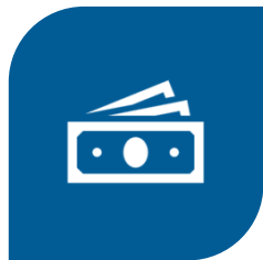
FLEXIBLE SPENDING ACCOUNT