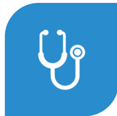
DEPENDENT CARE ACCOUNT